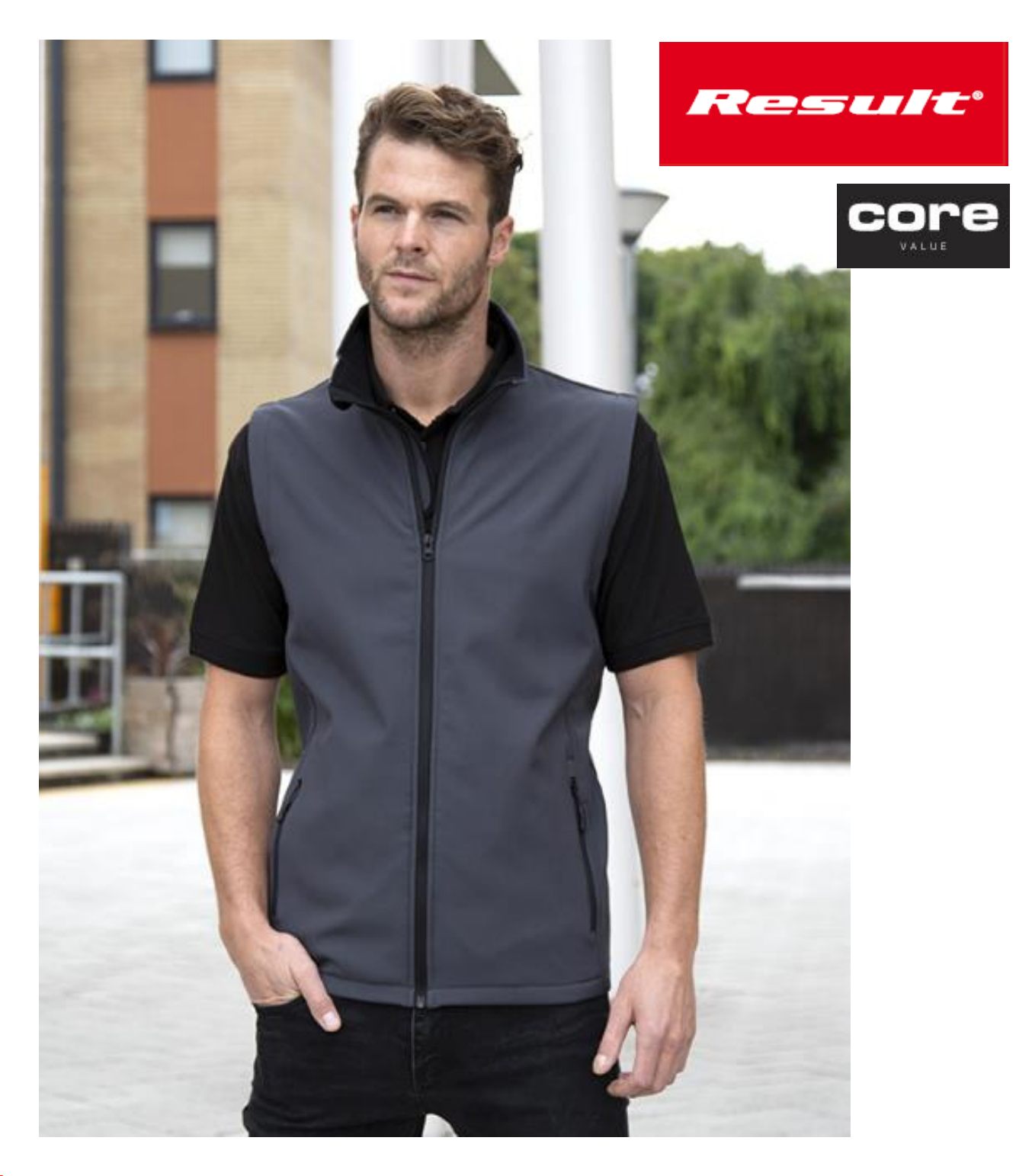
R232M MENS PRINTABLE SOFTSHELL BODYWARMER